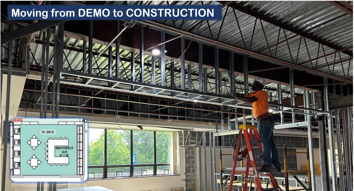
Figure 1 New Makerspace Lab area takes shape as framing gives way to drywall. This new space will increase opportunities for hands-on learning, problem-solving, and creative experimentation for our students.