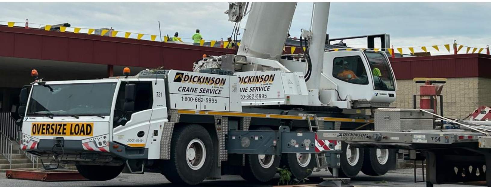
Figure 2. Crane service allowing for Poly ISO Roof Insulation Boards and equipment including curbing to allow for installation on the new RTUs (rooftop units).

Roof work at both the Middle School and Liberty Bell ES is in full swing as both contractors have made excellent progress with the Middle School at 50% completion and Liberty Bell at 40%. Albeit challenging with thunderstorms always a threat in summer, both projects are on schedule and proceeding nicely.